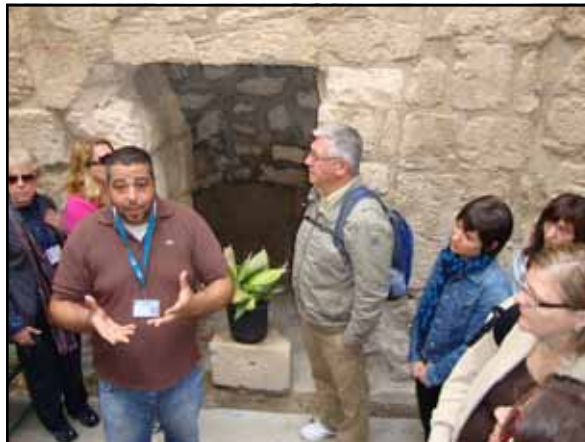
Guide and pilgrims at entrance of tomb where Jesus raised Lazarus from the dead

As soon as we leave Bethany, we enter the Judean desert. We see Bedouin camps on the side of the road. This road takes us along the Dead Sea, on our way to Masada, a site that is sacred to Israelis. We take a cable car up to Masada, which is a fortress on a 1,300 foot high plateau. Masada is best known for a first century tragedy: in the final stage of the First Jewish-Roman War , the troops of the Roman Empire laid siege to Masada, where that last remnants of the Jewish rebellion had taken refuge with their families. As the Romans were breaking through Masada's fortifications, there was a mass suicide of the Jewish rebels (960 people). They preferred death at their own hands to death and/or slavery at the hands of the conquering Roman armies. The Israeli military holds its swearing in ceremonies at Masada. It is a symbol of